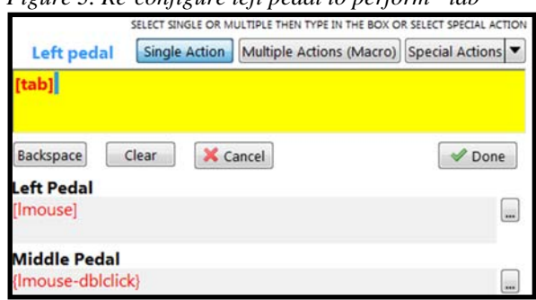
Figure 3. Re-configure left pedal to perform "tab"